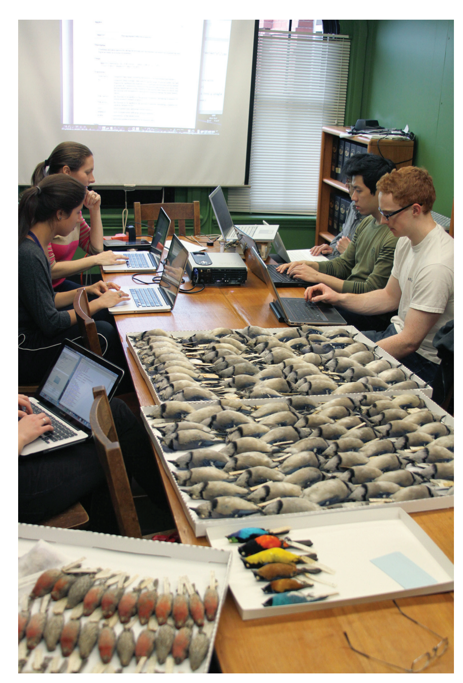
Figure 1. Undergraduate students at Harvard use specimens and associated data to explore speciation and molecular evolution in spring 2013.