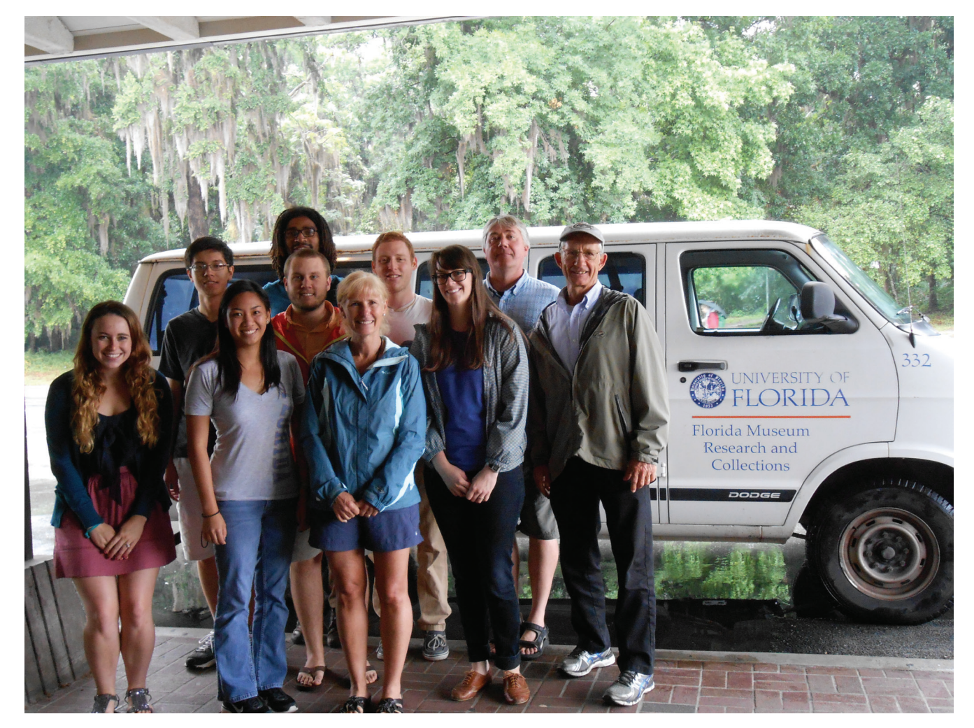
Figure 3. University of Florida undergraduate biology students on a museum field trip to collect plant specimens at the Ordway-Swisher Biological Station.

data. If they desire to do so, instructors can enhance the comparative component of the exercise by having different student groups focus on different plant species or conceptual issues. By coordinating with other instructors to conduct this exercise simultaneously at multiple institutions, students from different programs can interact online to enhance learning, foster interactions, and develop a collective and more collaborative perspective on scientific problem solving.